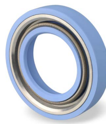
Rapid Machined Simmerring made of Fluoroprene® XP