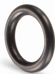
O-Ring made of EPDM