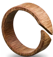
Guiding Element made of Laminated Fabric