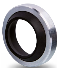
Elastomeric Wiper with Aluminum Housing