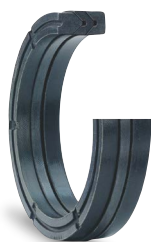
Merkel V-packing set EK made of NBR