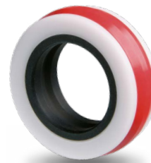
Compact Piston Seal made of NBR, PU and POM