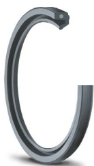
Merkel Radiamatic® RPM 41 made of NBR

The operating conditions in the process industry are very challenging. The used sealing products need to withstand aggressive cleaning and product media, high temperatures as well as extreme pressures. Additionally, they need to comply with industry- and country-specific legal regulations, such as those of the FDA or EU (Reg.) 1935/2004. Sealing solutions from Freudenberg Xpress® are tailored to these requirements and are thus suitable for use in the food, beverage, pharmaceutical and chemical industries. The portfolio includes original Freudenberg materials, such as the specially developed Fluoroprene® XP or 70 EPDM 291.